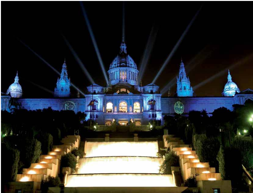
Photo of the building at night. Venue for the PHW event