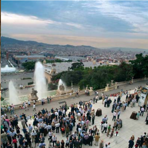
Photo of the lobby and terrace of the MNAC. Venue for the PHW event